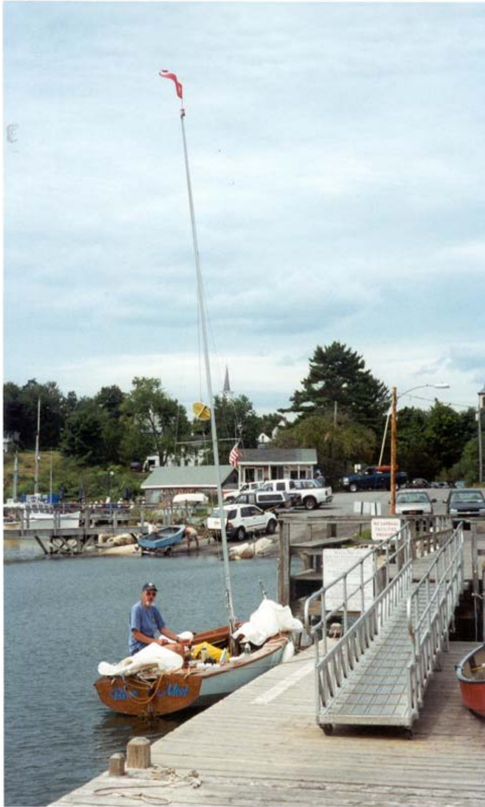
Our destination for Saturday evening was Harbor Island, which is in the middle of Muscongus Bay. But since we had gotten away in early afternoon and the conditions